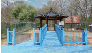
Dobo Bridge (Mock-up)