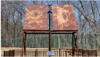
No Border Crossing Sign