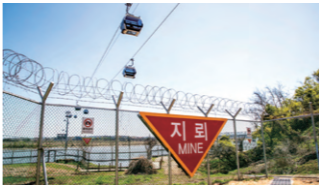
DMZ Station Photo Zone